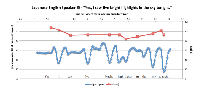
Figure 4: Plot of F0 (in red) and jaw movement (in blue) for very low-level L2 speaker J5, sentence (1)

For J5 (fig. 4), the relatively poor speaker of English, we see (1) neither a gradual declination of F0 (as seen for A1), nor a rhythmic alternation of F0 (as seen for J1), and (2) a pattern of jaw opening very different from that of A1 or J1. For one thing, the jaw seems to be open to almost the same degree for "I", "five", "bright", "high", "lights", "sky", and "night", with the largest jaw opening on the final word, "night." Moreover, we also see additional small jaw openings for the coda of "saw" and "five", and the word "the" has a large separate jaw opening.