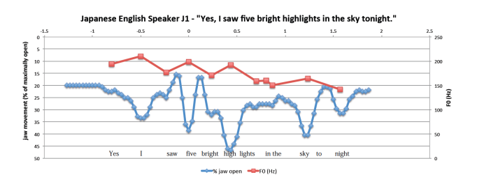
Figure 3: Plot of F0 (in red) and jaw movement (in blue) for advanced L2 speaker J1, sentence (1)

opening such that for each word high F0 is associated with a large jaw opening, and low F0 with a smaller jaw opening. It is as if this good speaker of English is using both F0 and jaw opening to produce a rhythmic pattern of English.