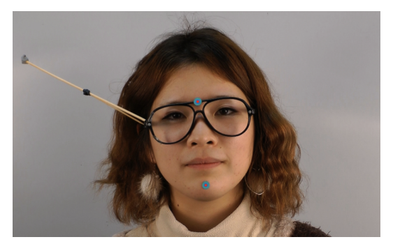
Figure 1: Position of blue markers (red dots indicate automatically calculated marker centroids).