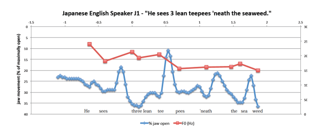
Figure 6: Plot of F0 (in red) and jaw movement (in blue) for advanced L2 speaker J1, sentence (2)

except that, of course, the amount of jaw opening is much less for /i/-vowels than for the /aJ/ vowels. For the A1 and J1 speakers, there is a similar pattern of jaw opening and F0, except that for J1, the jaw opening seems to be even more dramatic than for A1. Also, for J1, F0 is highest for the initial word "he". This is also seen for J5, and is most likely a carry-over from Japanese prosody, where sentence initial syllables/words tends to have the highest F0. Also noteworthy is that for the poor speaker of English (J5), the largest jaw opening is on the non-content word "the", whereas for the good speaker of Japanese and the A1 speaker, we see no such jaw opening.