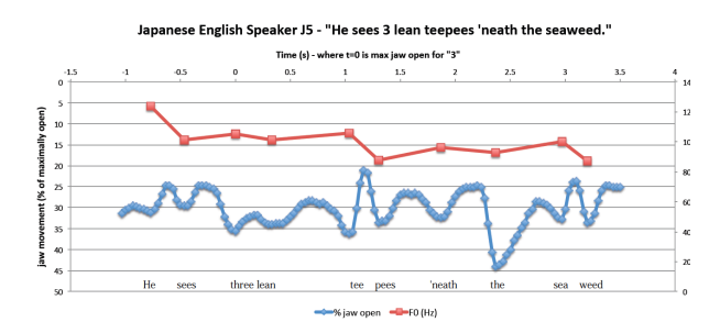
Figure 7: Plot of F0 (in red) and jaw movement (in blue) for very low-level L2 speaker J5, sentence (2)